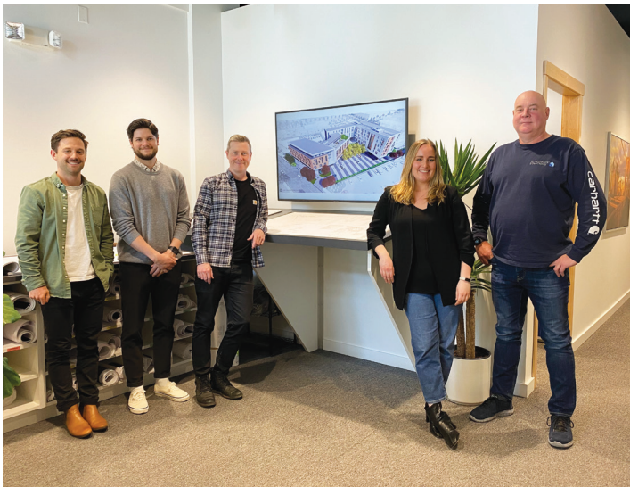
TL HOUSING SOLUTIONS DEVELOPMENT AND CONSTRUCTION STAFF SHOWCASING A CROSSTOWN RENDERING IN THEIR OFFICE.

Stay tuned later this year for the launch of the Crosstown tenant improvement project campaign, supporting the completion of our Dr. Joe Haegert Community Health Centre, social enterprise training kitchen and café, and arts collective.