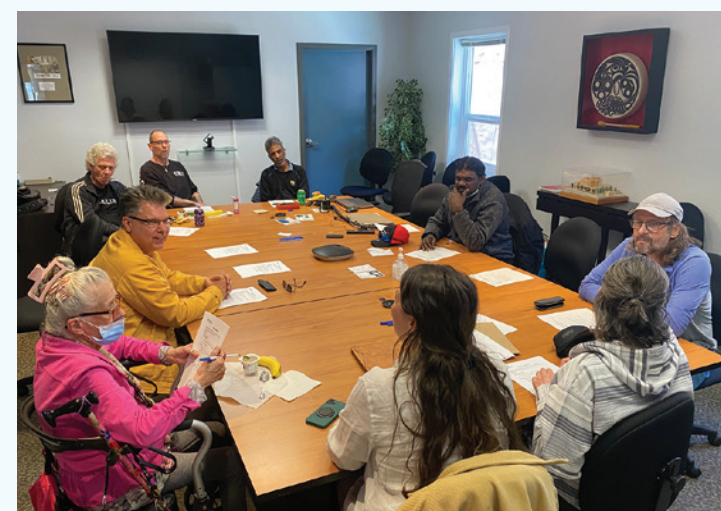
THE LIVED EXPERIENCE ADVISORY COMMITTEE MEETS EVERY SECOND FRIDAY.

The Lived Experience Advisory Committee was integral to many important initiatives across the organization this year, including a film project focused on advocacy, anti-stigma and education for high school students; participation in the planning and delivery of Project ReConnect; participation in the CRD's Coordinated Access Community Dialogues, and Cool Aid's Belongings Management Working Group, to name just a few. Cool Aid continues to focus on the growth and expansion of peer support and peer-led Initiatives, including expansion to seven sites.